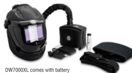
DW7000XL comes with battery powered air respirator.